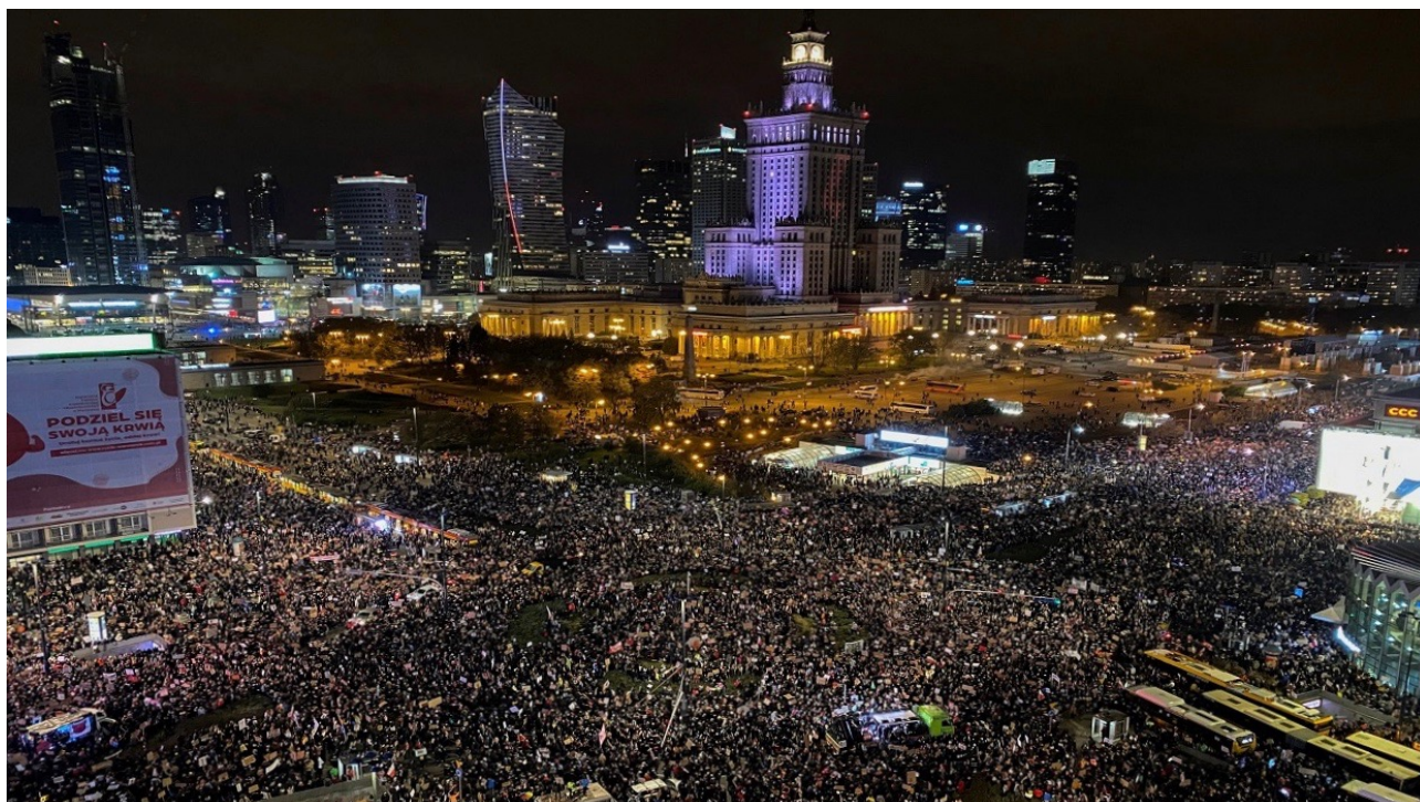
Protests in Poland against the country's constitutional court's anti-abortion ruling.

Now, with a conservative majority in the US Supreme Court, the threat of Roe v. Wade being reversed is larger than ever. This could plunge the country back to the days before the landmark ruling — for instance, a survey conducted in the 1960s found that among low income women in New York City, 80% of those who had gotten an abortion had attempted a dangerous, self-induced procedure. According to official data, by 1965, illegal abortions resulted in one-sixth of all pregnancy-related deaths in the country. The actual number of deaths is estimated to be much higher.